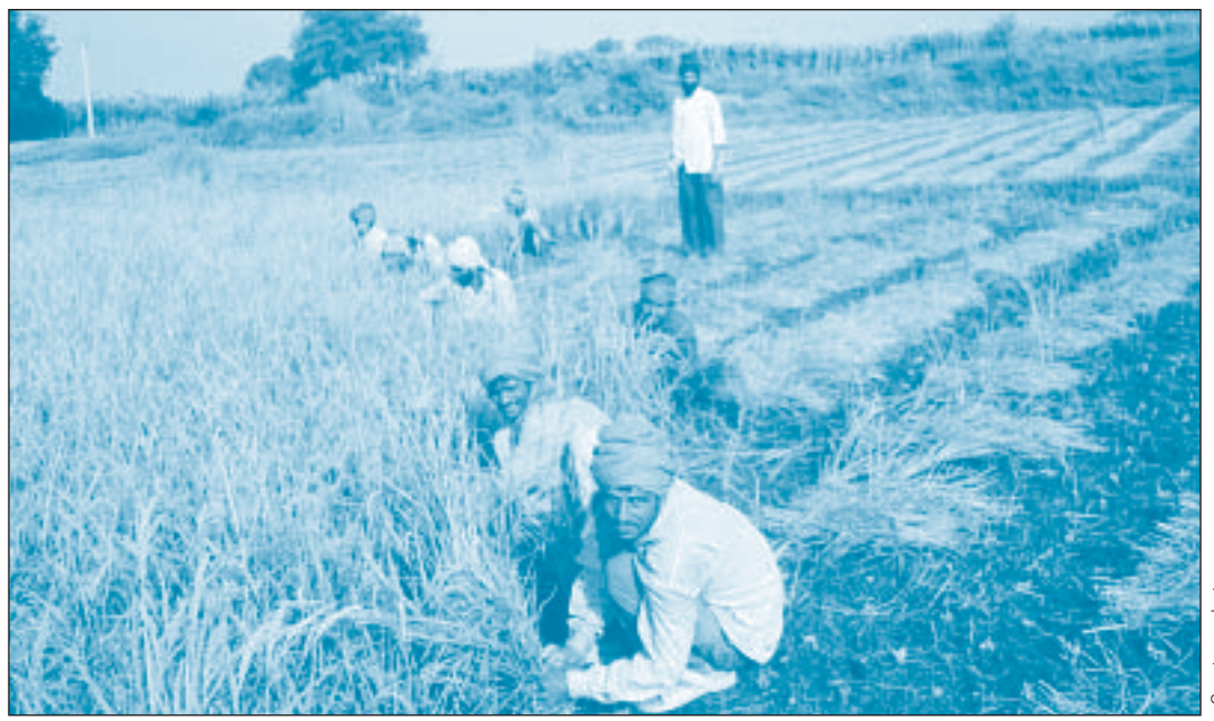
Migrant labourers in Punjab's agriculture

in the area nor are they taken into consideration during planning and governance processes.