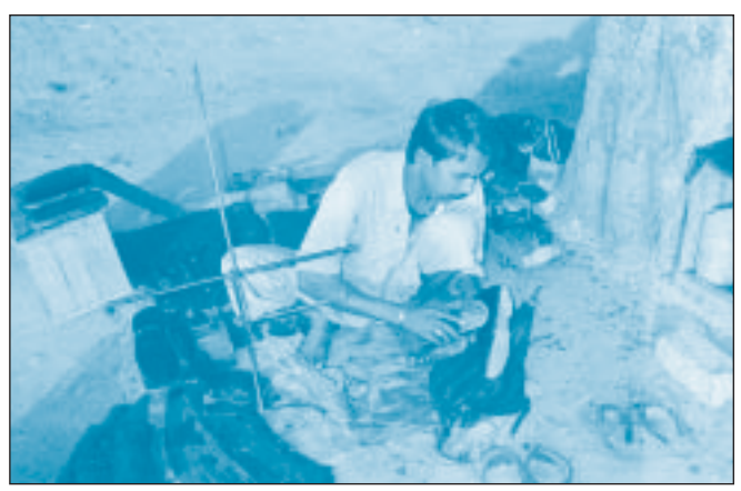
Dalits in traditional occupations

The social status of the Dalits in Punjab is not simply the result of poor literacy, employment and health. Rather, it grows from the centuries-old social, economic and political discrimination. Thus the