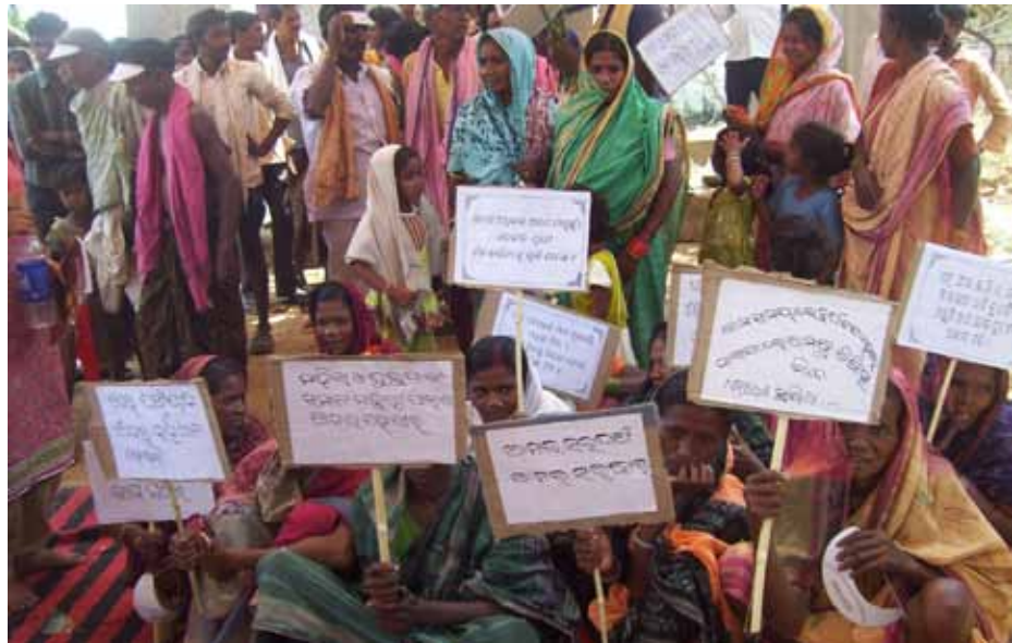
Women workers in the Rally of Job seekers Union