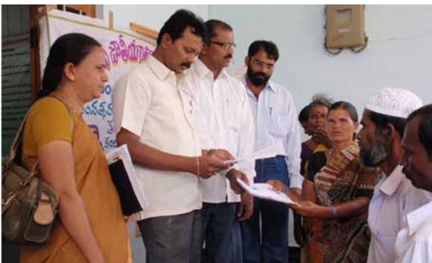
Dharna organised by Kadiri mandal federation and Memorandum submitted to MPDO and MPP

wage seekers in Dorepalli (14 members), Darveshapuram (12 members), Parvatagiri (3 members) and Charlagauvram (4 members) villages of Nalgonda district managed to secure their reimbursements to the tune of Rs 48,488.