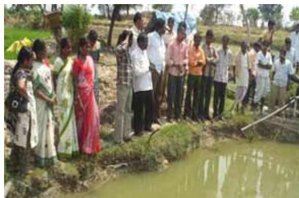
NREGS workers learning about inland fisheries work taken up under NREGS in Nalgonda

interventions and livelihood promotion through resource use apart from worksite facilities and tool banks in a few villages. In the last year, all the 7 partner organisations together facilitated creation and filling of 435 compost pits, intercropping in around 850 acres, vegetable cultivation in around 150 acres, green manuring in around 180 acres and fisheries in 10 tanks. Some of the organisations (PILPUPU and APMSS) have promoted backyard poultry units in some of the villages on an experimental basis.