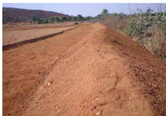
Farm bunding in Ananatapur district, REDS

More than 8,500 acres were developed of which SC/ST lands account for more than 50% (Table 2.6). The development of fallow or less productive assigned lands of SC/ST into productive land was the priority for the consortium partner organisations who facilitated the process of identifying and developing assigned lands of the poor. There is a significant increase in the percentage of assigned lands brought into cultivation. This is evident from the sample data from the base line in the selected villages (Table -7). Of the selected households (mostly SC and ST), the total percentage of cultivated land in 2007 is around 13% where as it has increased to around 60% by 2010. Land development works such as jungle clearance, deep ploughing, land leveling, tank silt application, contour trenching, pebble bunding, farm bunding, digging of farm ponds, compost pits etc were taken up in these lands to make them productive.