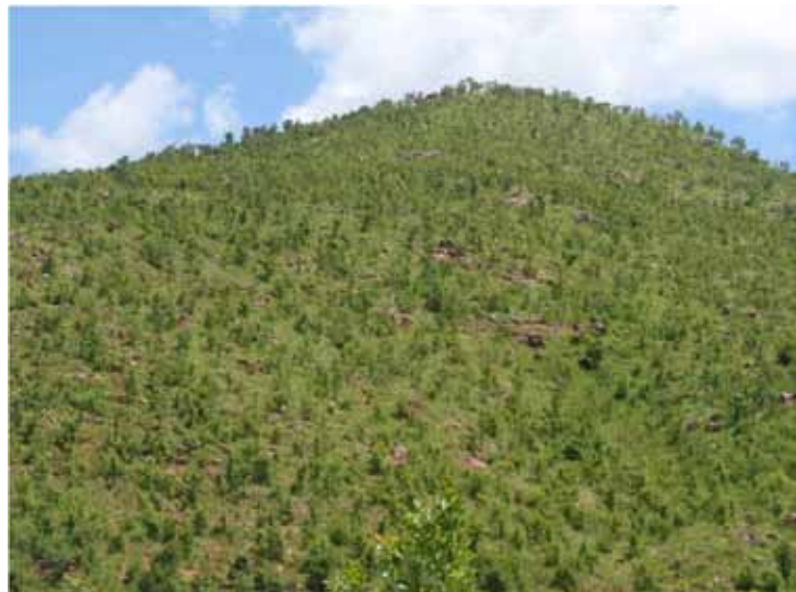
CPR block, Ananatapur, REDS