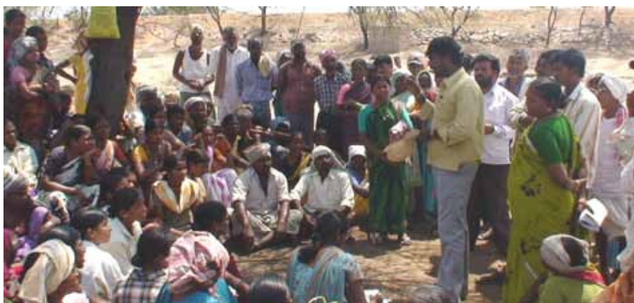
Workers meeting at work site, Nalgonda, AP, by PILUPU

APMSS in Nalgonda district helped 4 groups (80 members) to apply for unemployment allowance, but mandal officials didn't take any action although the issue was raised several times in EGS meetings at the district as well as state levels. The non-payment was largely on account of a lack of clear guidelines as well as delay in securing necessary approvals at the state level. State-level officials didn't disagree with the argument, but they were inclined to ensuring that employment was generated in time, and were indifferent towards ensuring the payment of unemployment allowance. However, the partners persisted with the demand for unemployment allowance, and after four years of the implementation of MGNREGA, the department formalised the system of work applications and receipts, and made it compulsory. The field functionaries (Field Assistants) are made responsible for conducting periodical meetings of wage labour groups and obtaining work applications in those group meetings as per the need and demand of the members.