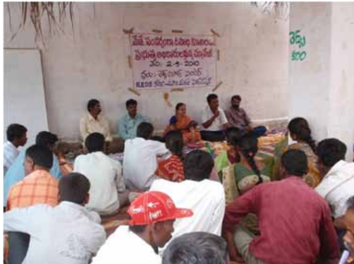
Convergence meeting on May Day, Anantapur, REDS