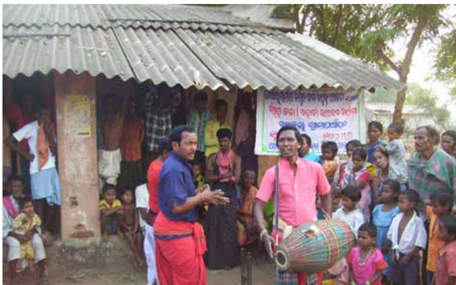
Village level awareness camp through folk dance.

out of the fear of being held liable under the law for not providing employment.