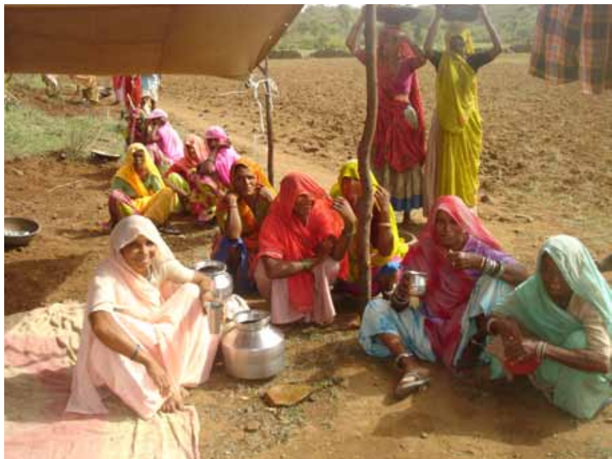
Work site facilities at work place, in Rajasthan

Persistent follow-up with the Panchayat samitis helped in ensuring all the assured facilities in the consortium project Panchayats and FES operating Panchayats although there were numerous hurdles during the initial stages. In Phila Panchayat in Udaipur district worksite facilities were not provided when work began on a convergence project with PWD, because the Panchayat washed off its hands claiming that it was the responsibility of the PWD. Later the Phila wage seekers with the support of Prayatna Samiti pressurised Block officials to provide shade at worksite. In the Udaipur project villages of FES, facilities like tent for shade and drinking water are provided on worksite. In certain works being undertaken inside forestlands that have shadow trees, tents are not provided. Worksites in the project villages also employ a person dedicated to provide drinking water. Crèche facilities were provided once in a while but