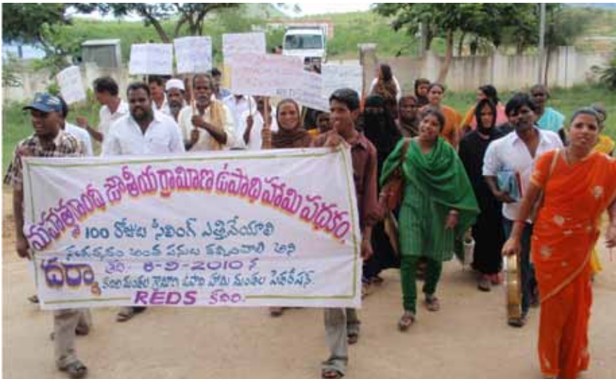
Demonstration to lift the cap of 100 days of work, Kadiri, Anantapur, AP