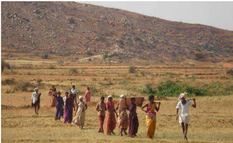
Returning from work; Kadiri, Anantapur