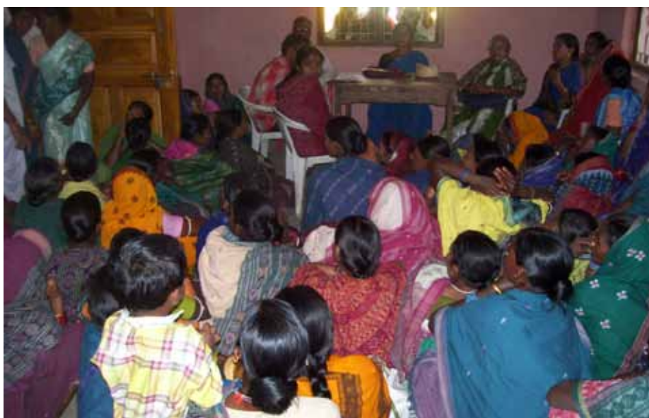
GP Level Meeting on NREGA; Empowering people through sharing of information

In FES operating districts, those who managed to work for 100 days are in a minority. In some cases, families with no job cards adjusted themselves with the work force of families possessing job cards thereby making the cumulative man-days reach the 100 mark. Reluctance of job card holders to tap the MGNREGA channel could be on account of many reasons: projects being implemented far out of their village, types of work that doesn’t suit them, and lack of awareness on fixed wages. Further, there were more projects and investments in road construction/rural connectivity and other infrastructure projects that are not labour-intensive.