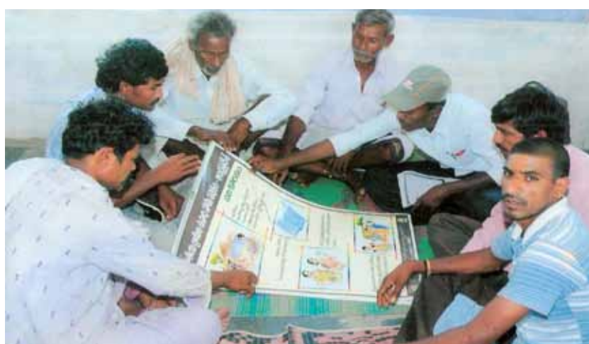
Mandal committee training, Tarlupadu, Prakasam district, AP, by EFFORT.

Intensive campaigning and awareness programmes in the project villages resulted in increased awareness on the process and procedure of MGNREGA among wage seekers. Yet, it was not enough for accessing wage employment as per the provisions in the Act. The main hurdle here was the rigidity shown by the implementation machinery in shifting from a supply-driven programme to a demand-based approach. After consortium members helped wage seekers engage with the implementation systems for almost a year, and set up workers' collectives, the number of wage seekers applying for work increased. They started getting receipts against job demand in the second and third years of work (Table 2.1). This system of obtaining receipts against formal application for work was almost absent throughout the state where there are no supportive organisations for wage employment seekers.