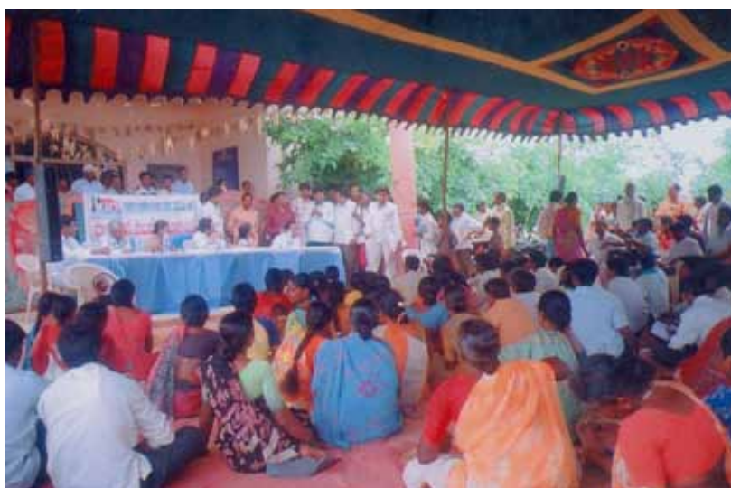
Social audit mandal public hearing, Kanagal, Nalgonda - APMSS

Wage seekers in the Nalgonda district, with the support of APMSS-Nalgonda, took to the streets seeking reimbursement of their long pending medical expenses. With the help of RTI, they obtained the list of wage seekers who received medical expenses. Names of the non-genuine members were highlighted and the list was pasted on the walls of Panchayat office. With this,