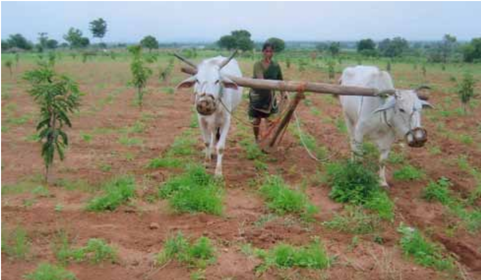
Horticulture, Koheda, Karimnagar, APMSS

of the wage seekers. The outcome of these pilots was shared with the district and state administration and is being considered for scale up.