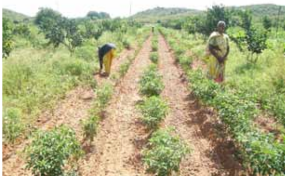
Promoting kitchen gardens, Srikakulam, ARTS