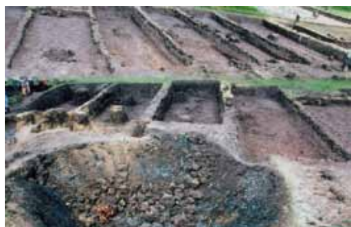
Works to renovate tank and excavation of silt, Mogullapally mandal, Warangal, APMSS