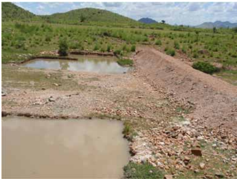
MPT works in CPR blocks, Ananatapur, REDS

The mandal and village EGS committees of wage seekers formed in the project areas offered good support in planning of works in their respective Panchayats, awareness generation on existing and new programmes/schemes/ GOs/Circulars under MGNREGA, mobilising wage seekers to participate in Gram Sabha/planning meetings etc. The partner organisations have achieved significant success in identification of works through participatory planning. From 2007-08 to 2009-10, they have identified 1,520 works worth Rs 18.90 crore through wage labour groups particularly of small and marginal farmers (Table 2.5). Out of that, the partner organisations could ensure completion of 749 works worth Rs 9.30 crore, and around 275 works worth Rs 6.45 crore are under progress. The works are mostly related to resource development and agriculture that include land preparation, land development, silt application, soil and moisture conservation activities, water harvesting structures like check dam, percolation tank, forest conservation, works to conserve and develop commons etc.