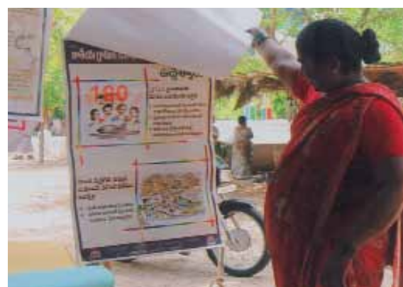
A wage seeker looking at a poster on MGNREGA entitlements at Kangal, Nalgonda (APMSS)