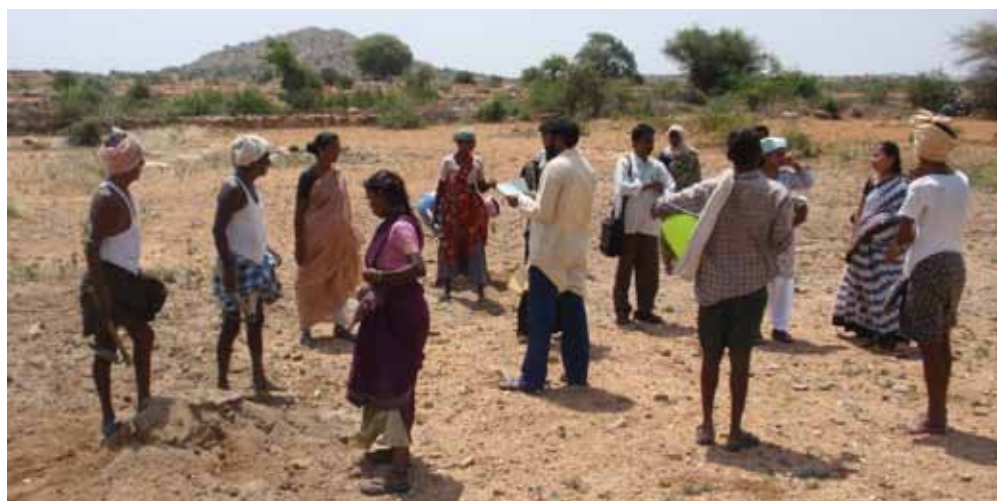
Guiding persons with disability in NREGS work, Kadiri Anantapur