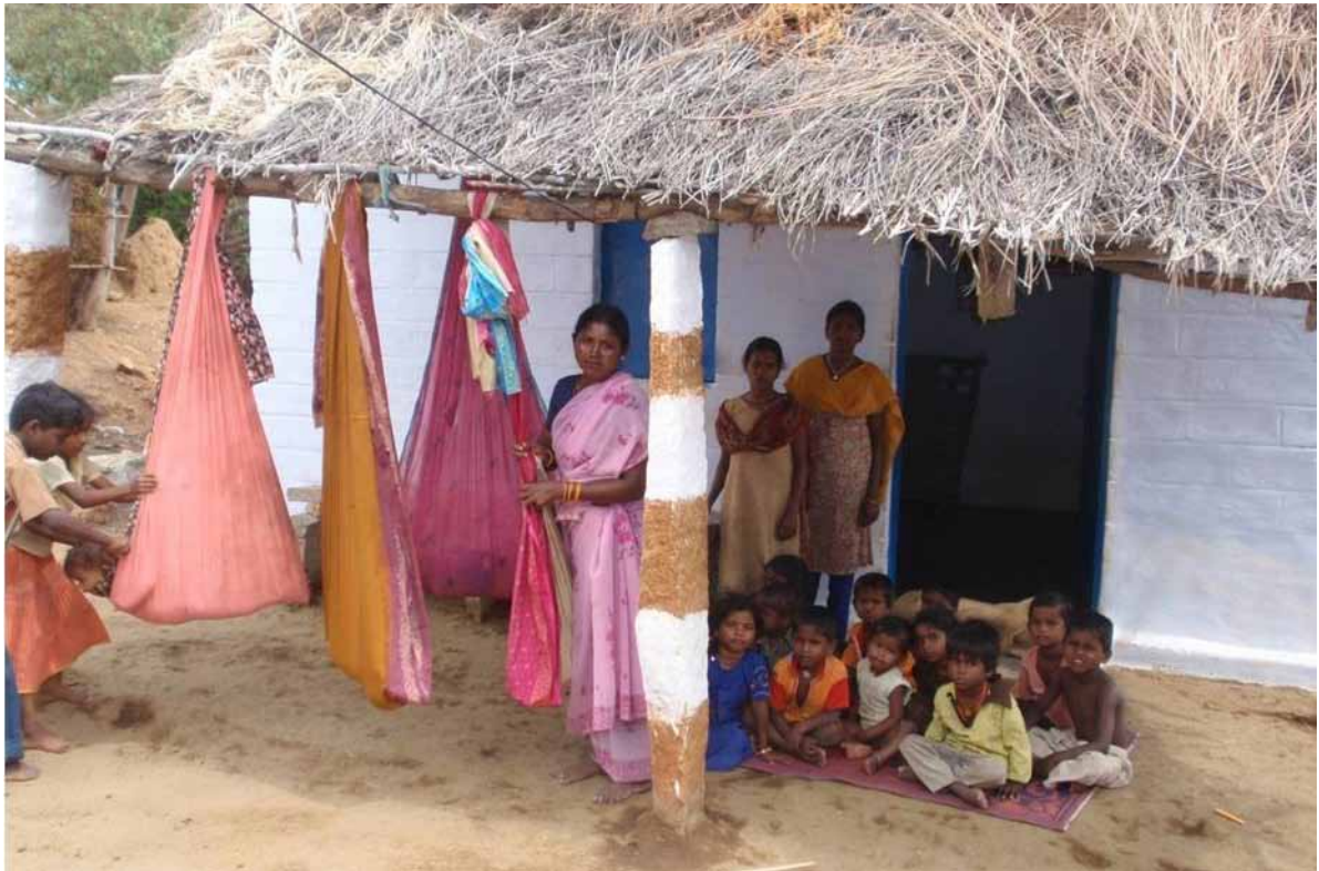
Creche for worksite meeting at K.N Palem, Anantapur district, Andhra Pradesh, organised by REDS.

REDS brought in Anganwadi centres as crèches for MGNREGA workers, thus ensuring the service of a maid as assured in the Act. REDS has done a pilot in its working village tying up with the Anganwadi centre and also provided ragi malt to the children at Anganwadi centres. AP Rural Development department had issued a circular No. 653/ EGS/PM (T)/2007, dated 20-04-2008 for pilot testing of linking of maids with Anganwadi centres in 5 districts, making it mandatory to provide a maid for every 100 wage seekers either at worksite or at Anganwadi centres along with provision of nutritional food to the children. This year government has issued orders to upscale and mainstream this system.