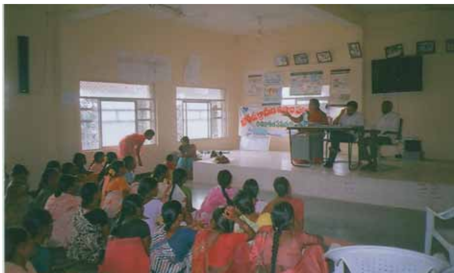
Mandal interface meeting with officials at Kangal, Nalgonda (APMSS)

WASSAN has also brought out a handbook for field level practitioners based on the experiences of partner organisations in organising communities and their engagement with the implementation systems of MGNREGA. This was widely circulated among all the organisations that are part of APNA. As part of sharing and advocacy, WASSAN