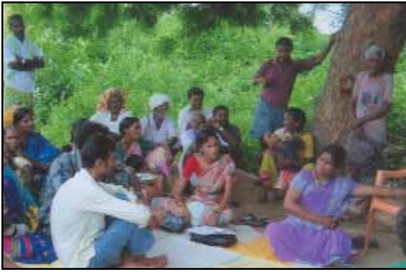
A labour committee meeting in progress at Koheda, Karimnagar (APMSS)

one year by the consortium members. The underlying principle in these two forms is that the primary responsibility of implementation of the scheme lies with the government but the job-card holders can only do the proper enforcement of the Act by actively exercising their rights provided in the Act. Increasing the interaction between the job-card holders and the implementation machinery can bring these two together. The partner organisations made efforts to build and strengthen those interactive platforms.