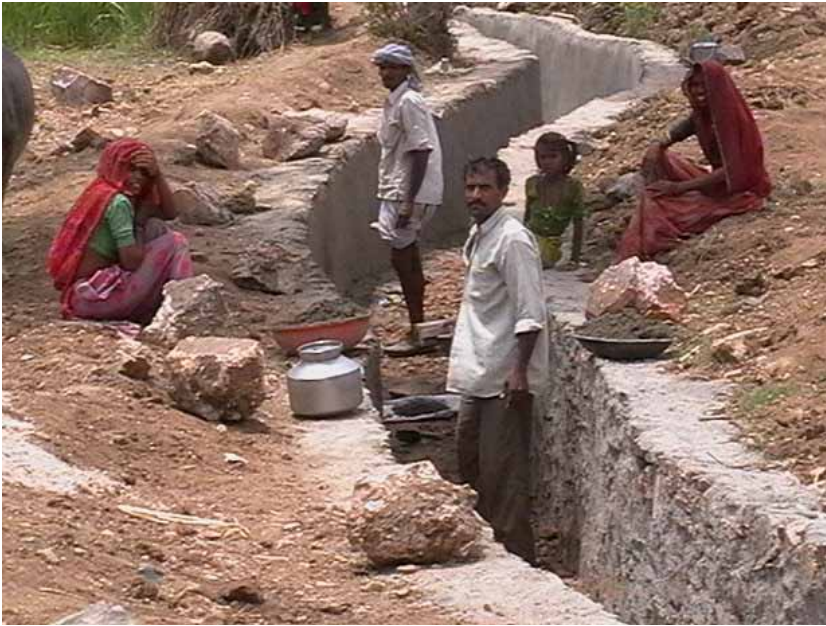
A field channel (Ghaura) constructed in Bhalokaguda GP in Girwa block in Udaipur district

aries in Jaisamand catchment area. Experiences of the VRC are shared and Micro-Plan preparation is done in action research mode. It is envisaged that VRC acts as a platform to share experiences of micro-planning and provide interactive advisories to local communities for watershed planning, land-use planning, water resources management, wasteland development, soil health management, consideration of ecological