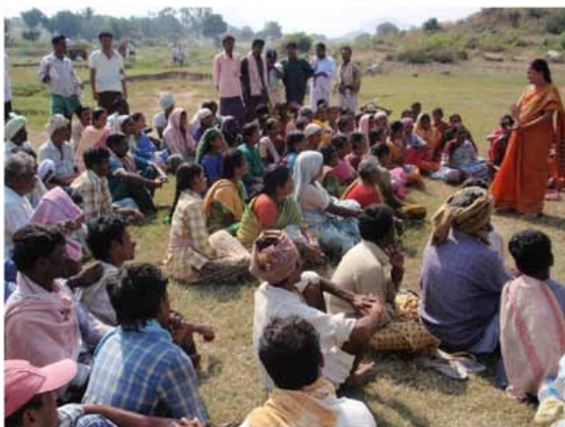
Work site meeting at K.N Palem, Anantapur District, Andhra Pradesh, organised by REDS

To address this aspect, the partner organisations