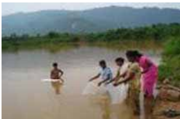
Fish farming in thier tanks, Srikakulam district, ARTS