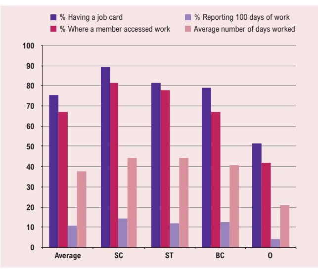
Figure 1. Rural households using MGNREGS in 2009