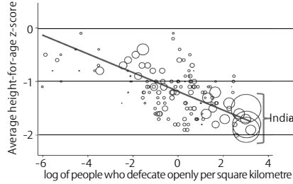
Figure 1: The Double Threat of OD and Population Density