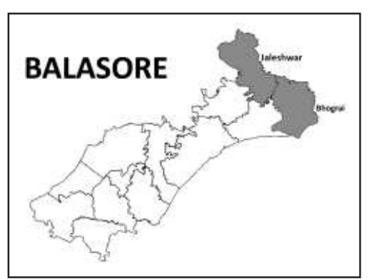
Fig. 5: Detailed map of Balasore district indicating Bhograi and Jaleswar blocks.