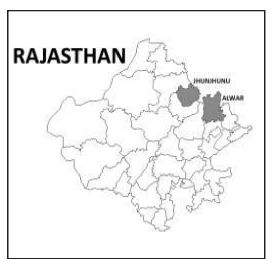
Fig. 2: Map of Rajasthan showing the research locations of Alwar & Jhunjhunu.

The district of Rohtak has many villages with a Child Sex Ratio of below 800. Jats are the predominant caste sub-group in the Blocks of Sampla, Lakhan Majra and Rohtak. They also own most of the agricultural land there. Mewat was selected as Meo Muslims form the majority there and this district has been projected in print media as a hub for trafficking of women/ brides to other parts of Harvana, Considered the most 'underdeveloped' region of Harvana, it boasts the best Child Sex Ratio (CSR) in Haryana in the census of 2011. Rewari has the Yadavs as the major caste sub-group. They are also the dominant landowners there. The district is one of the first places in Haryana where ultrasound clinics for prenatal sex determination emerged in the early 80s. The population in Jhunjhunu in Rajasthan consists of Jats, Rajputs and Muslims (non Meos). A comparative study of Muslims and Jats here with their counterparts in other research locations was responsible for its selection. Some parts of Alwar such as Umrain have Meo Muslims as the majority whereas the Blocks of Rajgarh, Thanagazi and Kishangarh consist of Haryana Brahmins , a got specific to this region alone.