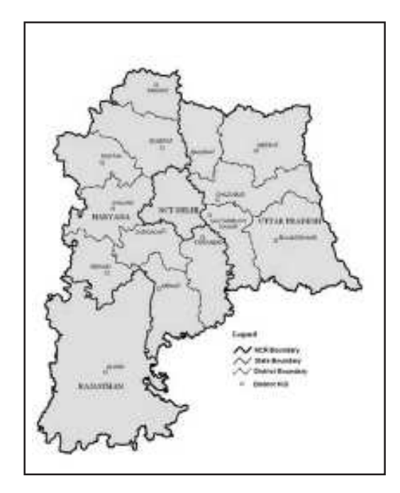
Fig. 3: National Region of Delhi spread over surrounding districts of Haryana, Rajasthan and Uttar Pradesh.