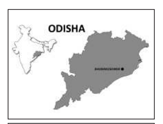
Fig. 4: Map of India showing Odisha in the east.

A cluster of 10 villages from Bhograi and Jaleswar blocks of Balasore district from the eastern province of Odisha was chosen for both phases of fieldwork based on a pattern of repetition of certain data from primary survey of conjugal areas to identify regions from where brides were coming (see Figs. 4 & 5).