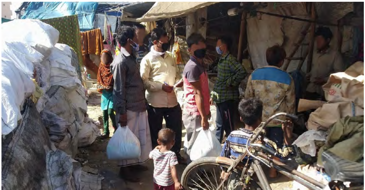
BSM distributing ration to members of a waste-picking community at Bhalswagan.

eight of ten workers in India work within the informal economy (Bonnet, Florence, 2019). This implies a challenge to the entitlement framework since by definition, many informal work arrangements are characterised precisely by the lack of access to social security benefits (NCEUS, 2009). Yet it also presents a particular set of delivery challenges. The conditions of informal employment do not just create and shape the nature of need, but they also confound processes of delivery. Entitlements struggle to reach informal workers precisely because the nature of their work make them hard to reach if: (a) they are mobile across regions, (b) beyond regulatory frameworks, (c) outside accessible or appropriately scaled databases; (d) in workplaces and residences that are hard to reach such as landfills, streets, construction sites and private homes; and (e) beyond the reach of usual delivery channels such as employers, fair price shops, anganwadis or through direct bank transfers. It is the effectiveness of design and delivery that this report focuses on. We do so not because we believe the existing entitlement frameworks