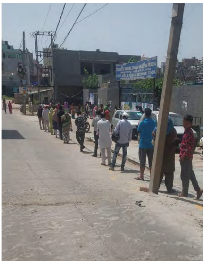
An e-coupon issued by the Government of Delhi to avail ration as relief; A queue for obtaining state offered ration.