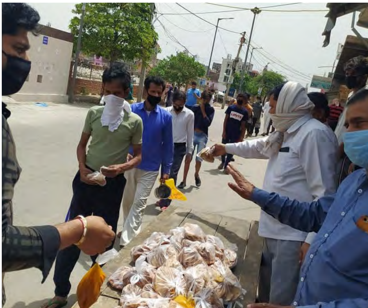
Cooked food being distributed to migrant workers by BSM at Meethapur, Delhi.

health support program, and institutionalised home delivery of food and dry ration to high risk individuals early in the lockdown. The Delhi government included additional cooking materials and hygiene products in its universal relief kit along with the central government's stipulated dry ration entitlements. Such acts of responsive relief entitlements and support makes the relief more comprehensive.