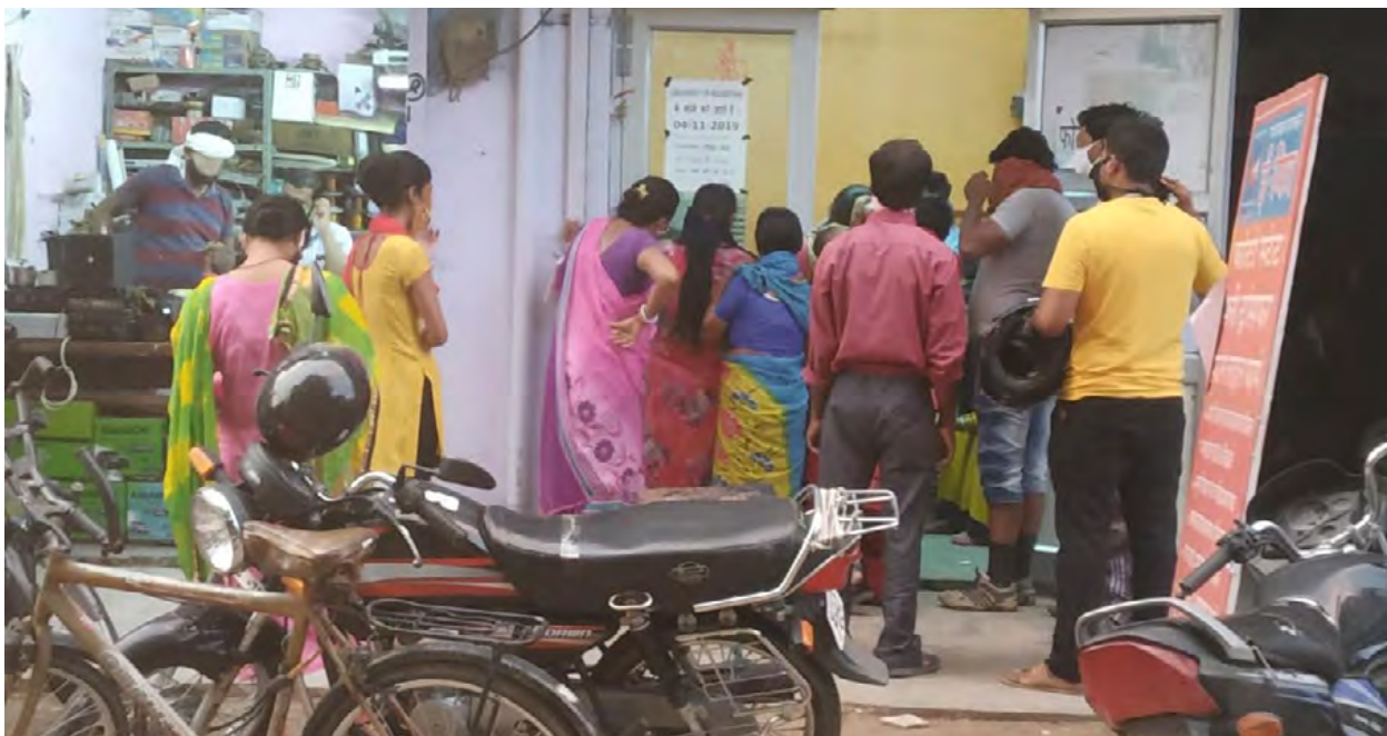
Individuals trying to register phone numbers with Aadhaar at an e-mitra kiosk to become eligible to receive ration.

when the state uses something like the BPL for delivering both pension and Antyodaya, it is essentially layering. And while certain decisions created layering in relief, it was not necessarily by design.