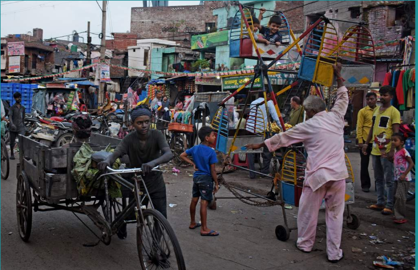
A child working in Wazirpur Industrial Area.

"A friend of mine had gotten a job in a well established company. They let him go when they realised he lived in a jhuggi" - Resident of Badli JJ Colony