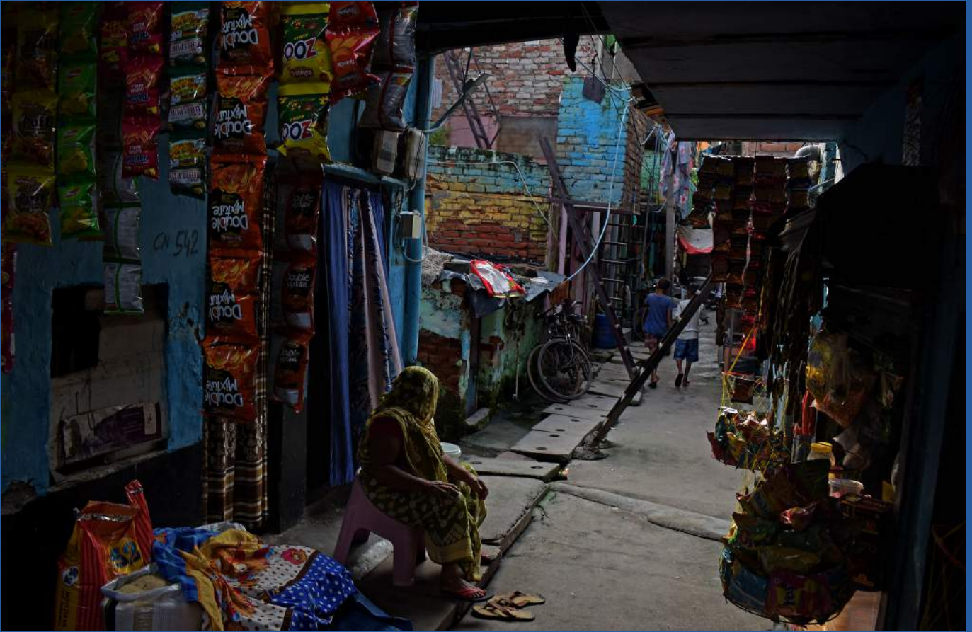
Shops in the alleys of Badli jhuggi.