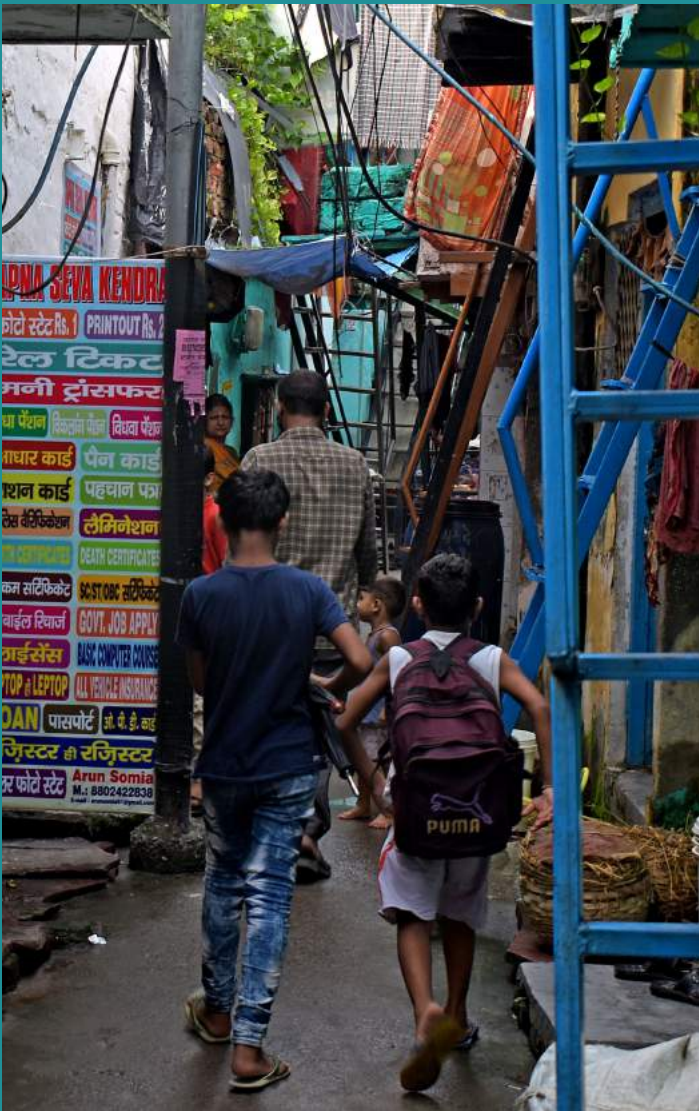
Kids headed for tuition in Badli jhuggi.

Overlooked by their parents, the children of these migrant workers are deprived of formal education, congenial social environment and parental presence. They spend most of their day playing in the alleys completely unsupervised, exposing them, very early on, to intoxicants and a patterned ferocity.