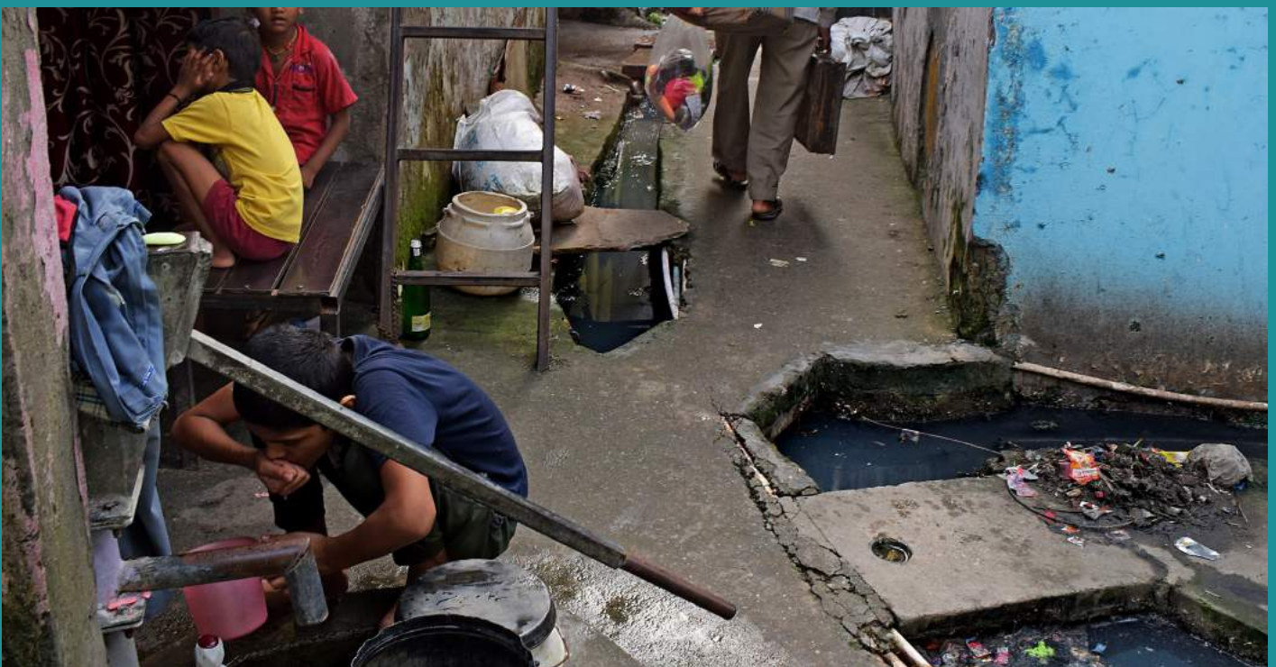
The open gutters in Badli jhuggi

These children then grow up in a trend of following the crowd. They drop out of school and work as labourers instead of improving their skills, trapping them in a vicious cycle identical to that of their parents' generation.