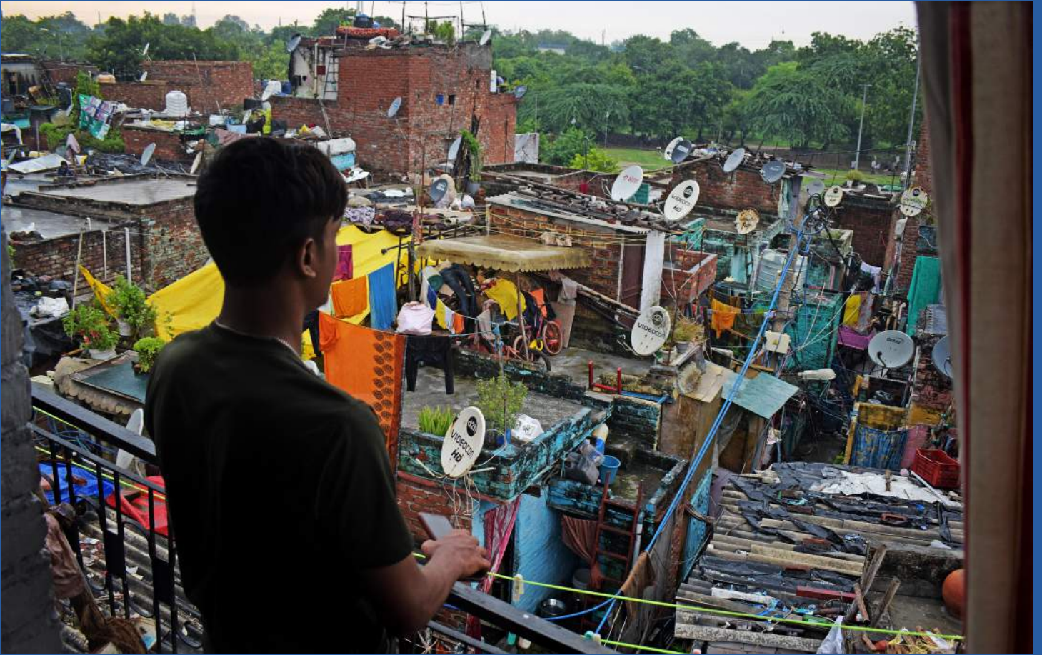
Overlooking Badli jhuggi