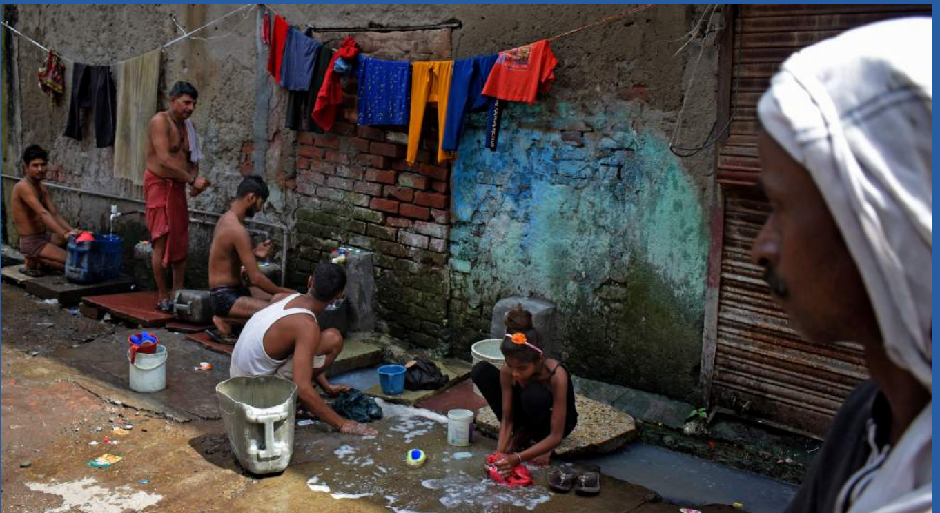
An outdoor wash-place in Wazirpur Industrial Area

As women spend hours cleaning, cooking and looking after their children early in the morning, men wake up just in time to get ready for work. Just as both of them leave for work together, the younger kids are left in the care of neighbours and the community elderly.