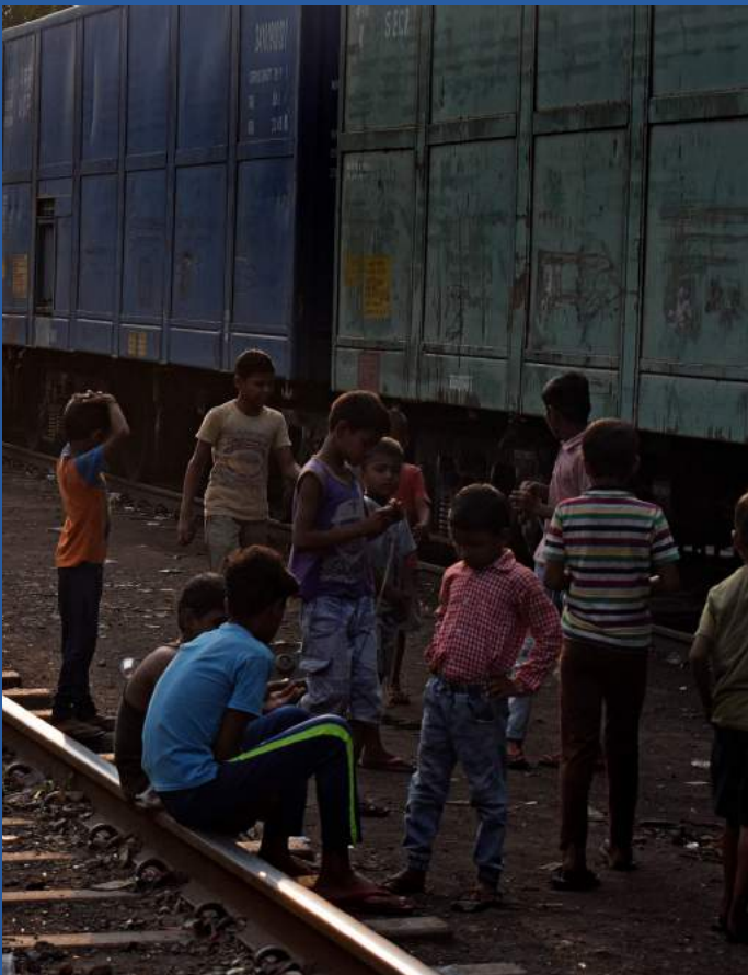
Kids playing on train-tracks in Wazirpur.