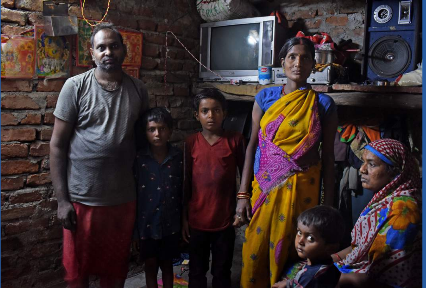
A family of 6 in Wazirpur Industrial Area.