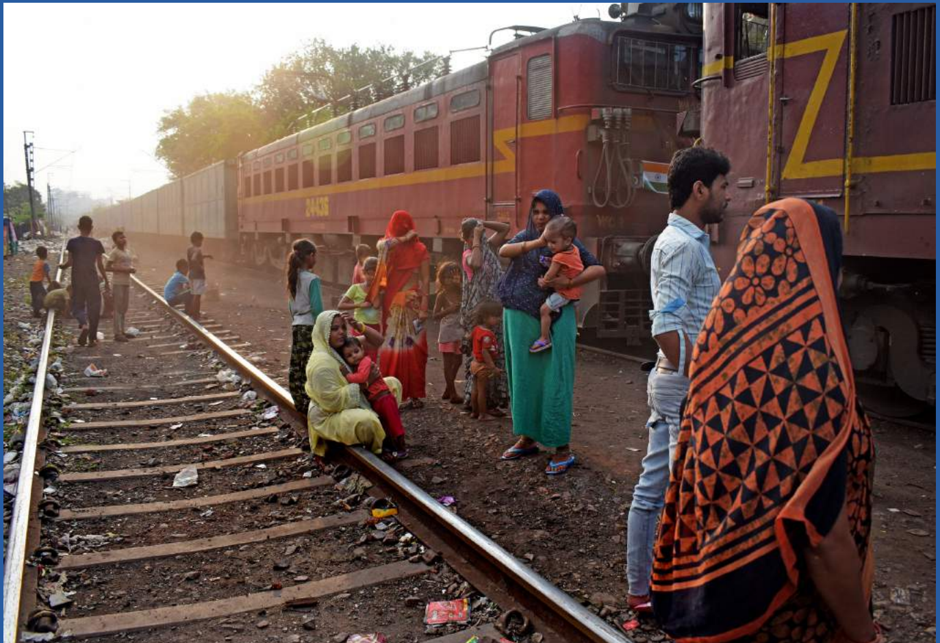
A gathering of people on the railway tracks in Wazirpur Industrial Area.