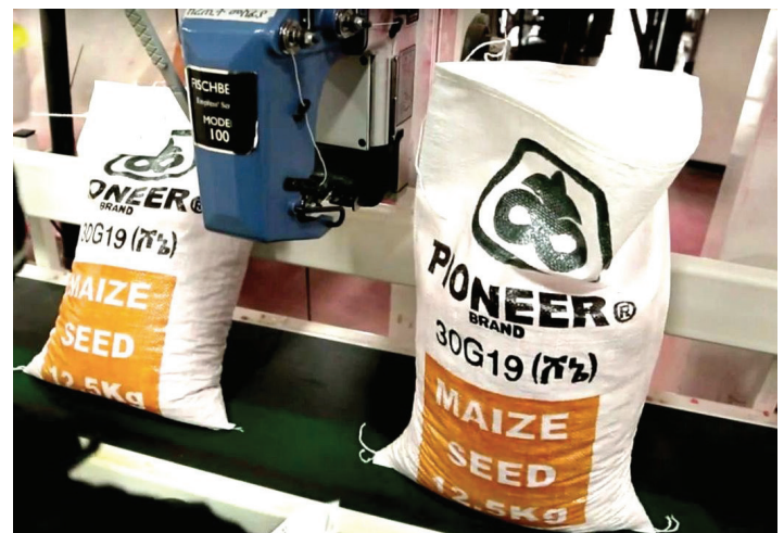
Dupont maize seed in Ethiopia

Furthermore, this model of fossil fuel-based industrial agriculture is laying waste to the environment. Food systems are responsible for 34 percent of all greenhouse gas emissions, with production processes, which include inputs such as fertilizers, as the leading contributor. 7 Nitrogen from these fertilizers is poorly absorbed by plants, and subsequently leaches into water systems and escapes into the atmosphere in the form of nitrous oxide. Long distance transport adds carbon emissions. Family farmers, pastoralists, and Indigenous communities who are the stewards of the land and guardians of agricultural biodiversity are marginalized and forced off their land, replaced by pesticide-reliant monocultures.