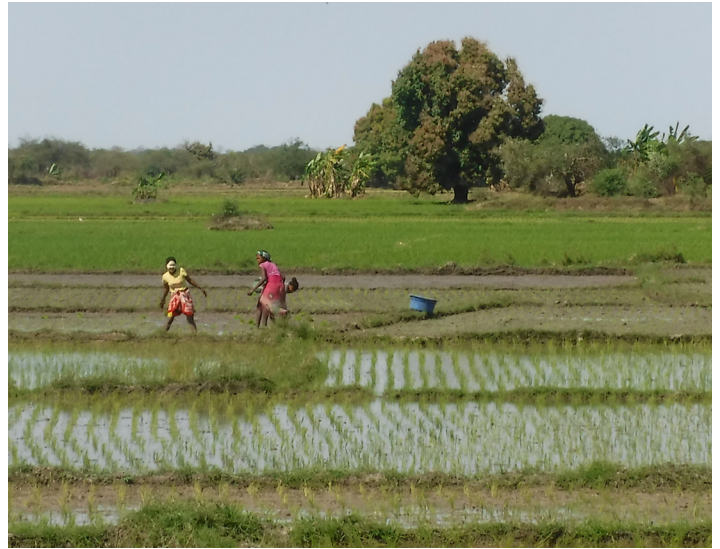
Farmers in paddy fields in Madagascar © The Oakland Institute.

The intense efforts deployed by these corporations and the international initiatives that support them to influence governments actually demonstrate that change is possible provided that governments can free themselves from their influence and start implementing responsible policies. Existing United Nations agencies and mechanisms constitute important assets that can support the design of such policies and establish international cooperation to support their implementation. But this will only be possible if the United Nations remain faithful