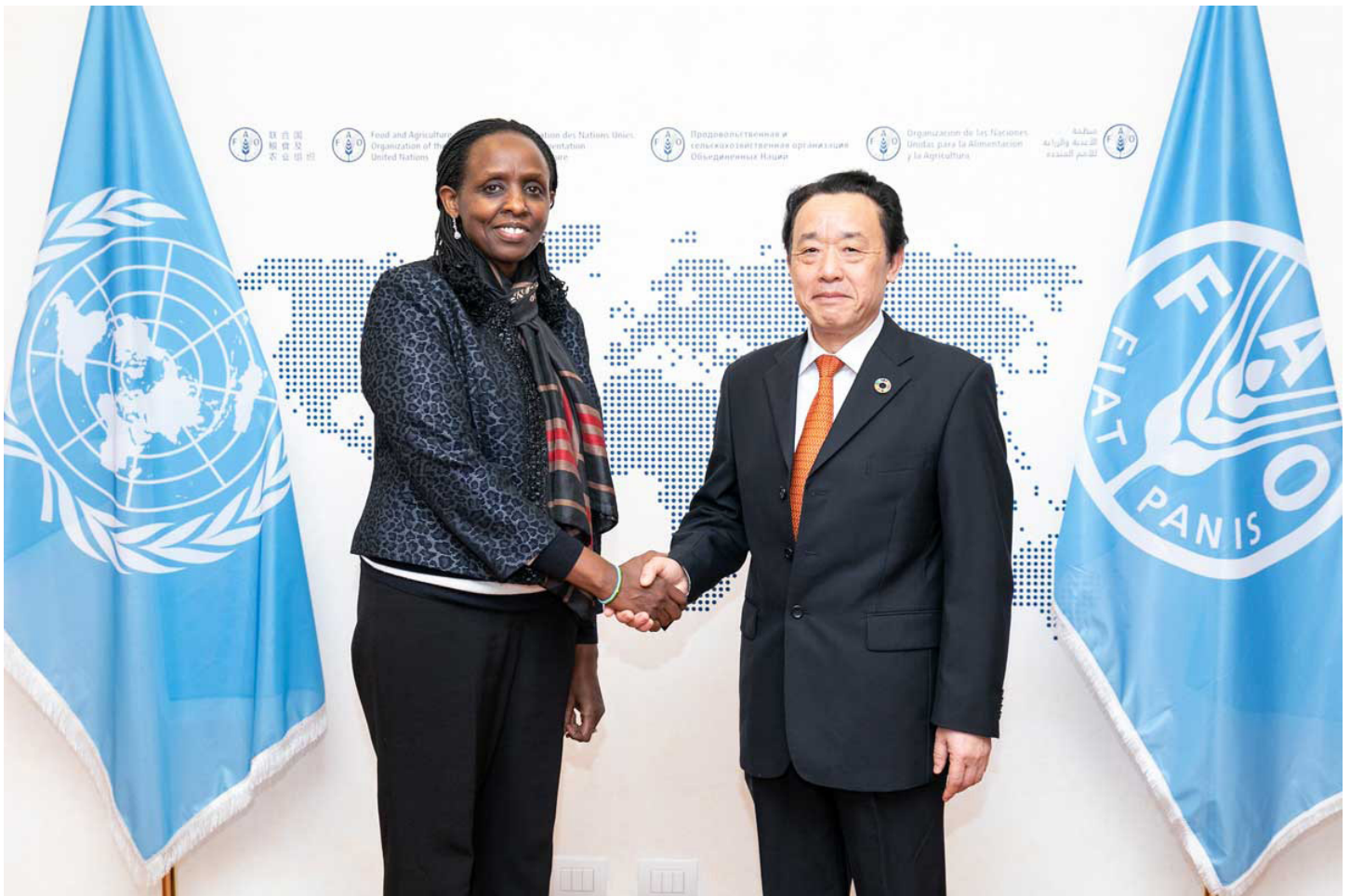
10 February 2020, Rome, Italy — FAO Director-General Qu Dongyu meeting with Ms Agnes Kalibata, Secretary General Special Envoy for Food Systems Summit, FAO headquarters.

Founded by the Bill and Melinda Gates Foundation and the Rockefeller Foundation, AGRA's efforts have centered on capturing and diverting public resources to benefit large corporate interests. Their finance-intensive and high input agricultural model is not sustainable beyond constant subsidy, which is drawn from increasingly scarce public resources. Since 2006, AGRA has worked to open up Africa—seen as an untapped market for agribusiness corporations controlling commercial seeds, genetically modified crops, fossil fuel-heavy synthetic fertilizers and polluting pesticides. This is an ill-conceived