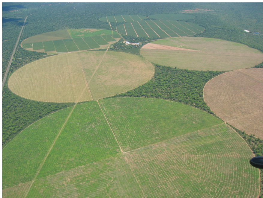
Industrial agriculture in Southern Africa

Five “Action Tracks” were announced in September 2020 to “offer all constituencies a space to share and learn, with a view to supercharging their progress by fostering new actions and partnerships and by amplifying existing initiatives.” Among the leaders of the “Action Tracks” were the Global Alliance for Increased Nutrition (GAIN), the EAT Forum, and the World Wildlife Fund (WWF).