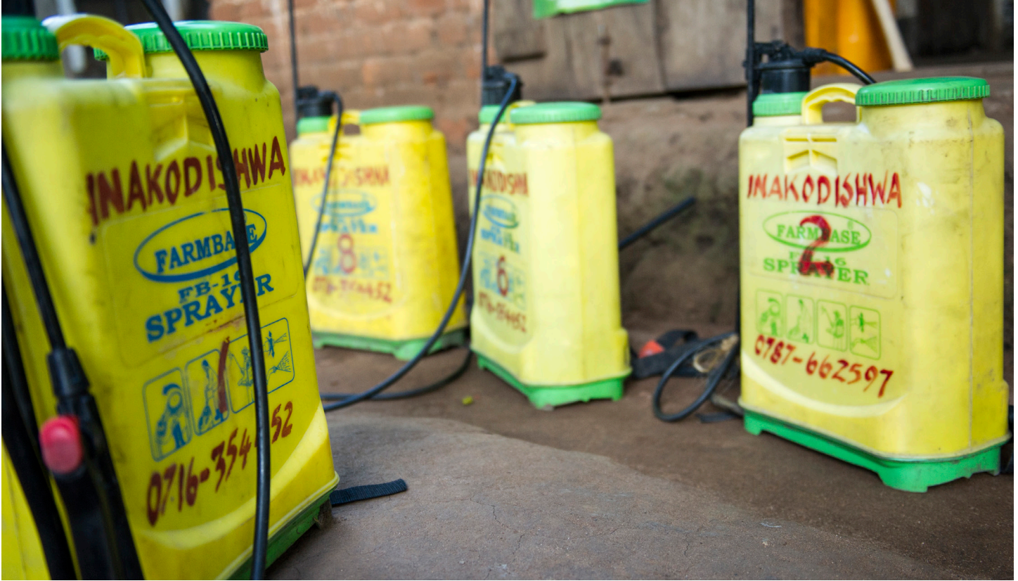
Sprayers for agrochemicals © Greenpeace.

approach focused on monocultural commodity production by large agribusiness at the expense of sustainable livelihoods, the planet, and the climate.