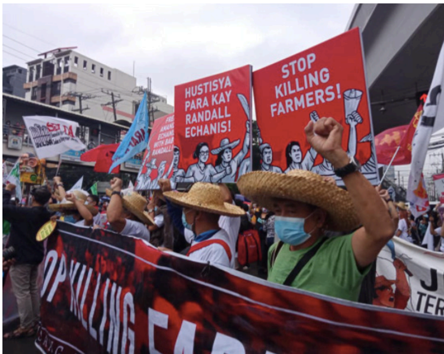
Farmer protest in the Philippines, January 9, 2021 © KMP.

With the historic global mobilization seen over the past year in opposition to the Food Systems Summit, millions of farmers and citizens from around the globe rose up to hold international institutions and their own governments accountable. Whereas the United Nations were created by states, in today's globalized and interconnected world, civil society organizations, building alliances across borders and sectors, have established themselves as a central actor to defend the universalist values and principles on which the international organization was built.