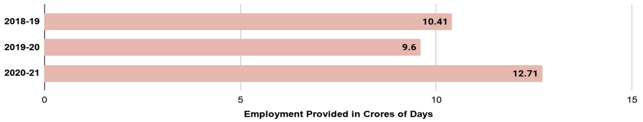
Figure 1: Employment Provided in TS for the same period (1, Apr -20, Oct) in the last three years

Employment provided in TS is 12.71 crore person days in the study period of 2020-21, the highest in the last 3 years. The increment in the total employment provided in the state in this year of Pandemic is evident from the graph below.